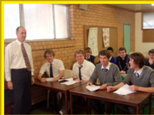
Above: Students from St. Edmund's College participating in the Technical Officials Training Program.