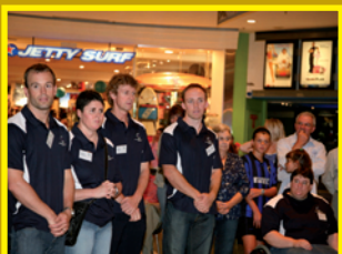
Above: Meet your favourite 2008 PSG Ambassadors.