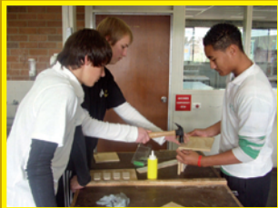
Above: Year 10 Students from Canberra High School V Tech Class constructing ticket boxes for the 2008 PSG.